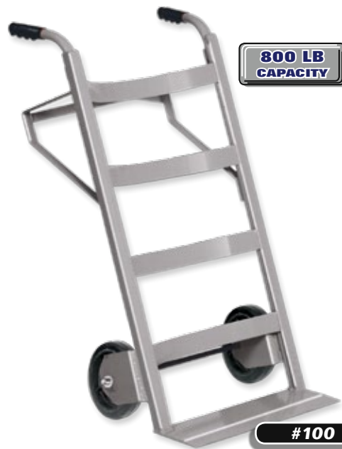
#100 Barrel & Drum Truck - Tubular construction with ball bearing mold-on rubber wheels, absorb shock, provide easy handling and quiet operation. Polymer grip handles. Balanced load exerted on the axle, bearings and wheels, and off the operators arms and shoulders. ■ Dimensions: 42" H, 20" W, Toe Plate 5" x 19" ■ Wheels: 8" x 2" mold-on rubber wheels ■ Capacity: 800 lbs. ■ Weight: 58 lbs.