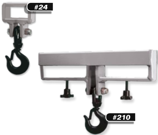
#24, #25, #26 & #210 - Easy handling by one person. In seconds the hooks can be slid on and tightened into place. Removes just as easily, no wrenches required. No. 210 Double Fork Hook has maximum openings, which permit an outside fork spread of 20-3/4". ■ Capacity: Single fork - 3,000 lbs, Double fork - 4,200 lbs.