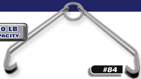
#84 Drum Sling - Lifts drum horizontally. The harder the pull, the tighter the grip on the drum. Use the drum sling to load your Pucel drum rack. ■ Capacity: 750 lbs. ■ Weight: 11 lbs.