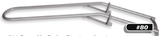
#80 Drum Up-Ender - Tilts drums from horizontal to vertical position with ease, speed & safety. Gives maximum leverage for lifting even the heaviest loaded drums. ■ Weight: 12 lbs.