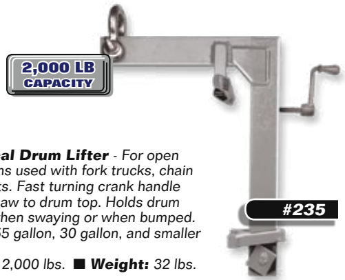
#235 Vertical Drum Lifter - For open or closed drums used with fork trucks, chain falls, and hoists. Fast turning crank handle to lock upper jaw to drum top. Holds drum rigidly, even when swaying or when bumped. Lifter moves 55 gallon, 30 gallon, and smaller steel drums. ■ Capacity: 2,000 lbs. ■ Weight: 32 lbs.