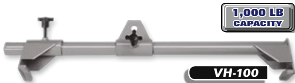
VH-100 Drum Lifter - Lifts from any angle. Load can be balanced. Easily adapted to lift objects of all shapes or lengths. Automatic "upsetting" of containers by adjusting sliding hoist collar. Holds rigidly even when load sways. Adjustment between jaws 16" minimum to 40" maximum. ■ Capacity 1,000 lbs. ■ Weight: 24 lbs.