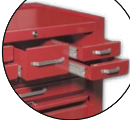
Tool Box TB-9

Nine smooth opening drawers on full extension slides.