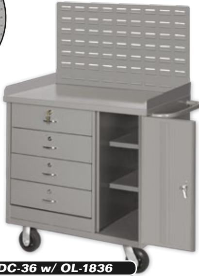
PDC-36 w/ OL-1836

Louvered or steel pegboard back is available on all PDC series models