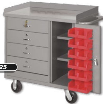
PDC-36 w/ IL-1225

PDC-36 Series - Equipped with four 20" W x 19" D x 5" H drawers on telescoping ball bearing slides. Each unit comes with separate cylinder locks in each drawer & keyed handle in door. Side & backstops prevent objects from falling off work area. Cabinet measures 12" wide x 26" high inside ■ Dimensions: 36" W x 20 1/4" D x 34" H. ■ Weight: 168 lbs. ■ Capacity: 2,000 lbs. ■ Casters: 2 swivel, 2 rigid 5" x 2" semi-steel or phenolic casters. ■ Options: Extra shelves, floor lock.