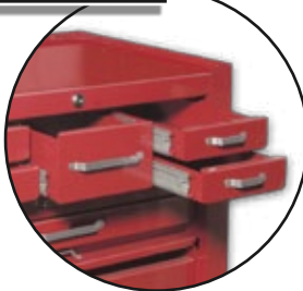
Tool Box TB-9

Nine smooth opening drawers on full extension slides.